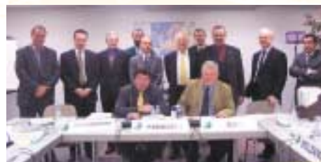
Presidents and Secretary Generals met with Federal Chancellor Vranitzky.

On 21 st June 1995, at the same time as the celebrations of the 10 th anniversary of the AER, in the Town hall of Vienna, the first Summit of the Presidents of member interregional organisations was held. Mr Jordi Pujol, the Presidents and Secretary Generals of the twelve AER member interregional organisations met in the Austrian Capital and discussed the role of the Regions in the new construction of Europe, a new organisation of the regional level in Europe and the development of interregional cooperation. These were, indeed, the themes of the political declaration that they adopted on this occasion. Following this initial summit, the