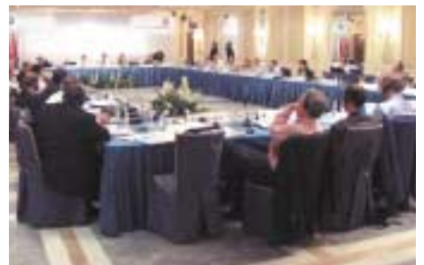
Members of the AER 'Institutional affairs' Committee debating in Madrid (14th May) on the AER position to be presented at the hearing of the European convention in June

*Available at www.are-regions-europe.org (index)